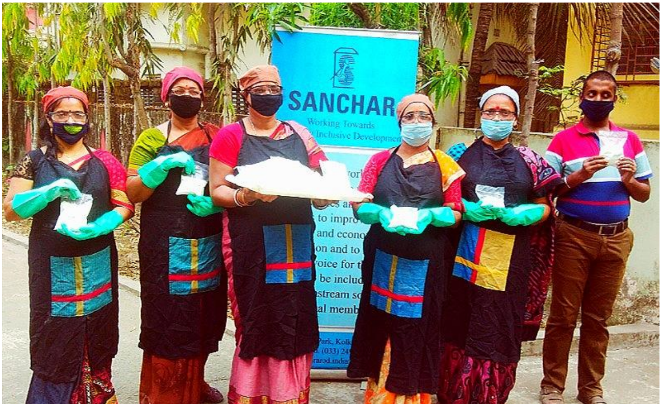
The handmade detergent powder is ready

This year, after COVID 19 and lockdown, the issues of livelihood got prime attention. Protecting Mother Earth, waste management, use of solar energy, rain water harvesting - all these issues are now our prime concern. So we started to discuss and analyse with the families and community on the different options for livelihood. We started Save earth campaign in the community. As an initial step we started training on Kitchen gardening and composting in Sanchar with the staff and parents with the guidance of Resource persons. We have also organized training on entrepreneurship, marketing of products, branding and digital marketing for young adults and parents. As the group was interested to do something, we trained them on detergent making, hand wash making, liquid floor cleaner and Phenyl making. As the next step we will be helping the group in packaging and marketing.