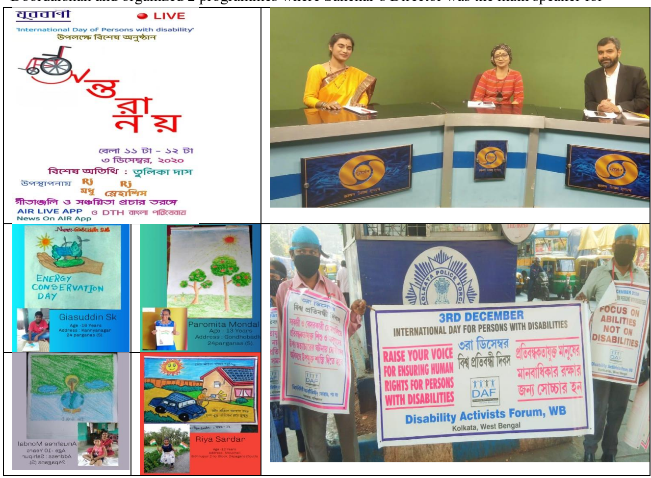
raising awareness on rights of PWDs, early identification, Entitlements —how to avail those etc.

This year, we have organized huge campaign to promote RPWD Act 2016 on 3<sup>rd</sup> December. We have organize several meetings and discussion with the different community stakeholders in our field area with the help young adults with disabilities and parents. We have joined the awareness rally of State level Disability Activists Forum. We have done advocacy with the All India Radio and Doordarshan and organized 2 programmes where Sanchar's Director was the main speaker for