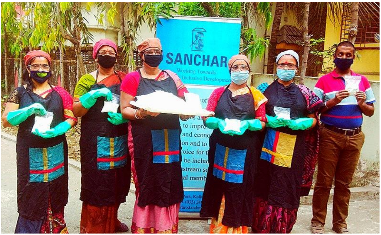
The handmade detergent powder is ready

This year, after COVID 19 and lockdown, the issues of livelihood got prime attention. Protecting Mother Earth, waste management, use of solar energy, rain water harvesting - all these issues are now our prime concern. So we started to discuss and analyse with the families and community on the different options for livelihood. We started Save earth campaign in the community. As an initial step we started training on Kitchen gardening and composting in Sanchar with the staff and parents with the guidance of Resource persons. We have also organized training on entrepreneurship, marketing of products, branding and digital marketing for young adults and parents. As the group was interested to do something, we trained them on detergent making, hand wash making, liquid floor cleaner and Phenyl making. As the next step we will be helping the group in packaging and marketing.